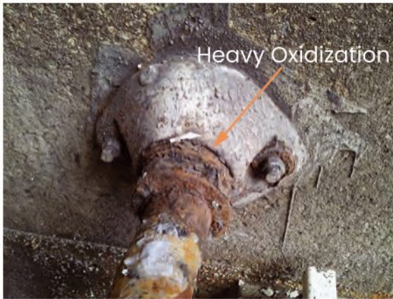
Metal Wall Bearing, corroded to the point that the shaft is frozen.

Metallic wall bearings are not well suited for clarifier applications. Ferrous materials corrode as soon as exposed to the influent leading to formation of oxidization which in turn inhibits the rotation of the shaft within the metal bearing housing. Eventually the drag becomes very high with more demand made on the drive to turn the shafts. With HMAX Non-Metallic wall bearings the shafts will always turn freely, grease or lubrication is no longer required and corrosion is never a worry. The natural lubricity of the HMAX Bearings provides superior long term service, and is ideal for dry tank or infrequent operation conditions. Available in bore sizes up to 4-7/16" diameter. For larger size bores consult our HMAX Split Peak Cap Bearing Bulletin.