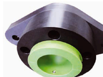
HMAX Wall Bearing

Qualitätskontrolle im eigenen Haus · 100% der Ketten vor Versand mit Prüflast getestet