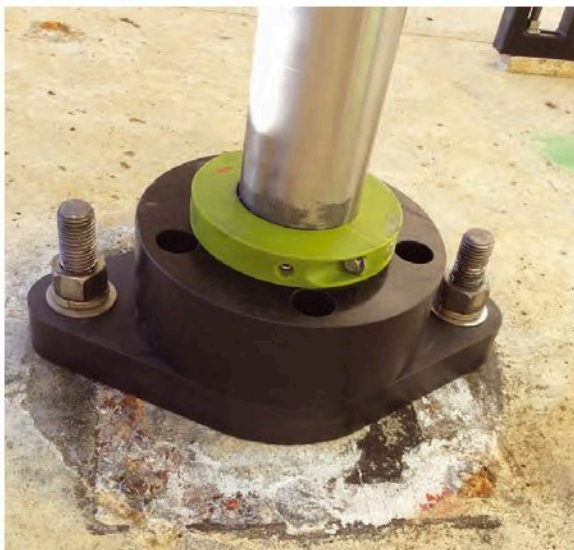
HMAX Non-Metallic Wall Bearing, shaft turns easily, no lubrication required.

Metallic wall bearings are not well suited for clarifier applications. Ferrous materials corrode as soon as exposed to the influent leading to formation of oxidization which in turn inhibits the rotation of the shaft within the metal bearing housing. Eventually the drag becomes very high with more demand made on the drive to turn the shafts. With HMAX Non-Metallic wall bearings the shafts will always turn freely, grease or lubrication is no longer required and corrosion is never a worry. The natural lubricity of the HMAX Bearings provides superior long term service, and is ideal for dry tank or infrequent operation conditions. Available in bore sizes up to 4-7/16" diameter. For larger size bores consult our HMAX Split Peak Cap Bearing Bulletin.