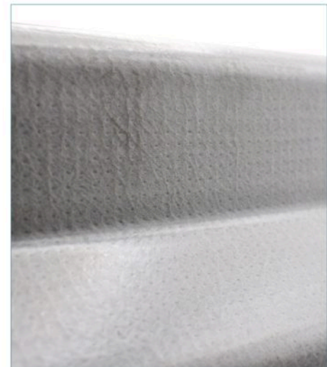
fiberglass reinforced plastic